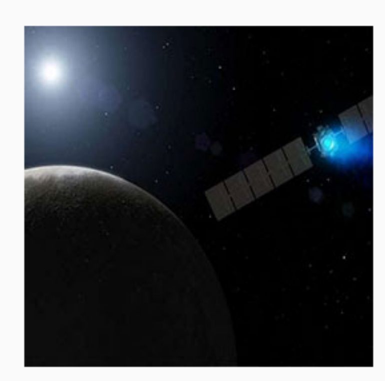
How Better Propulsion Systems Can Improve Space Exploration