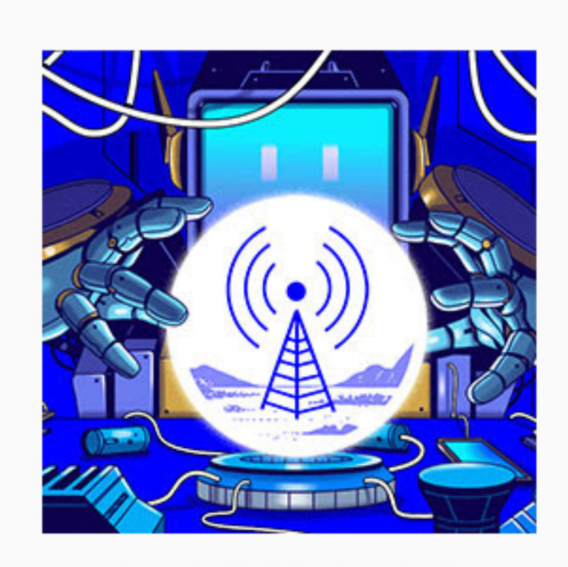
The Tech That Will Invade Our Lives In 2020